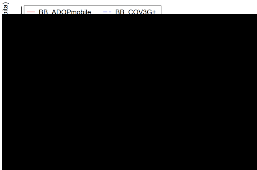
Figure 2. Per capita mobile broadband coverage and adoption (OECD mean values).

they move to fiber-based connections and adopt the new technology. Although fiber adoption rates have been slightly increasing in the last 10 years, they are still below 50% on average with respect to all deployed fiber connections. Adoption rates, however, typically cannot exceed 100%, as households usually do not subscribe to more than one fiber connection, which provides enough bandwidth capacity even in the case of concurrent usage of multiple electronic devices within households. Assuming an upper limit of 100%, the average OECD adoption rate at the end of the observation period was about 63%.